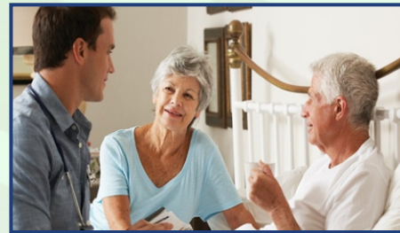
GERIATRIC HEALTH CARE ASSISTANT