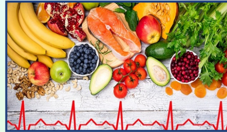
DIET & NUTRITION COUNSELLING