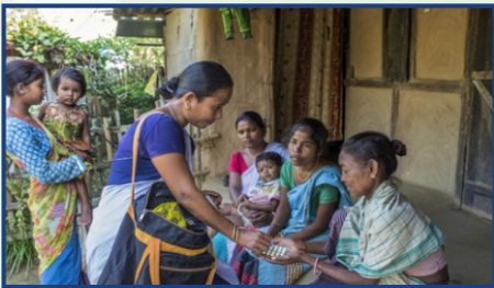
COMMUNITY HEALTH PROMOTER