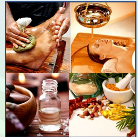
MASSAGE THERAPY, ACCUPRESSURE & NEURO THERAPY