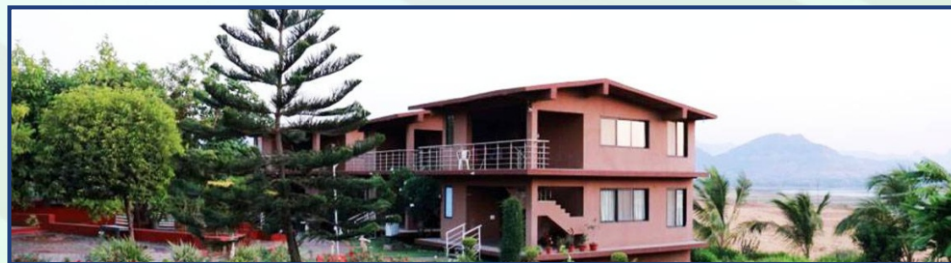
NATUROPATHIC HOSPITALS & RETREAT CENTERS