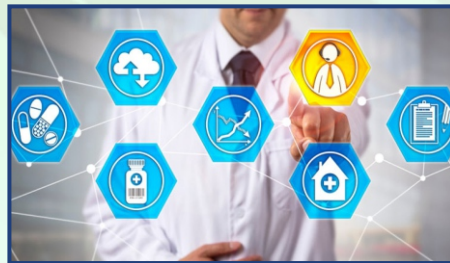
RESEARCH & DEVELOPMENT DEP.